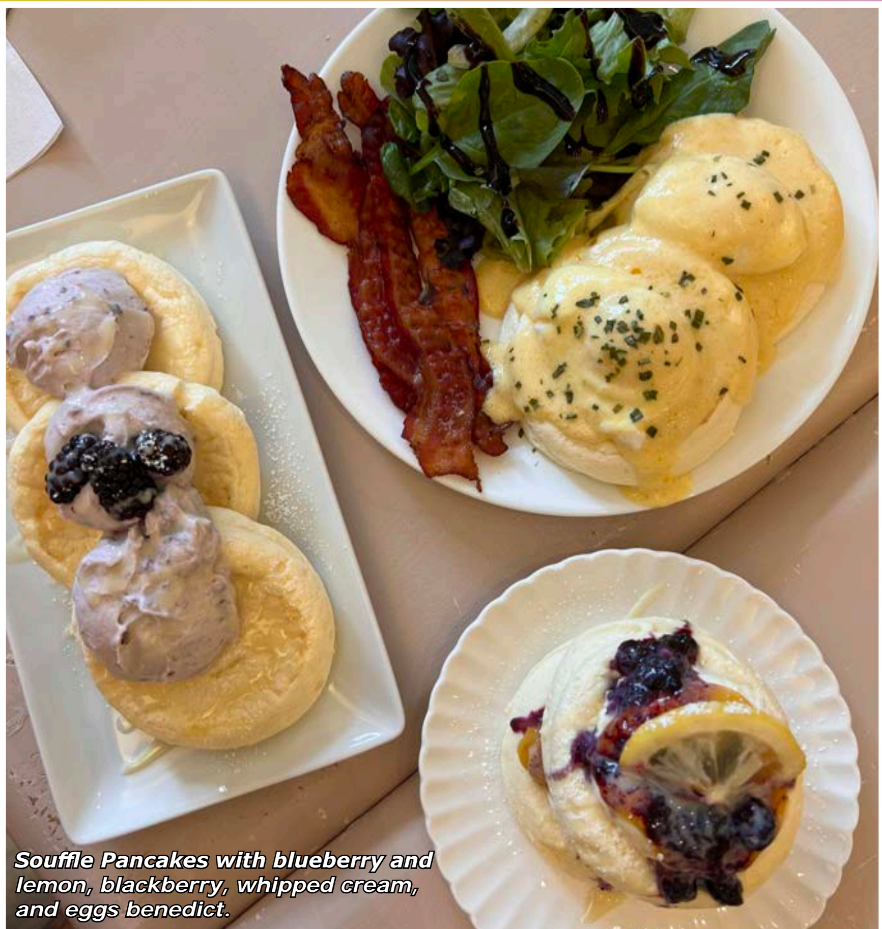
Souffle Pancakes with blueberry and lemon, blackberry, whipped cream, and eggs benedict.