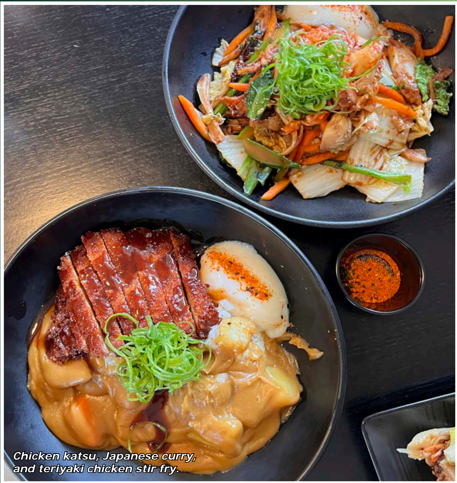
Chicken katsu, Japanese curry, and teriyaki chicken stir fry.