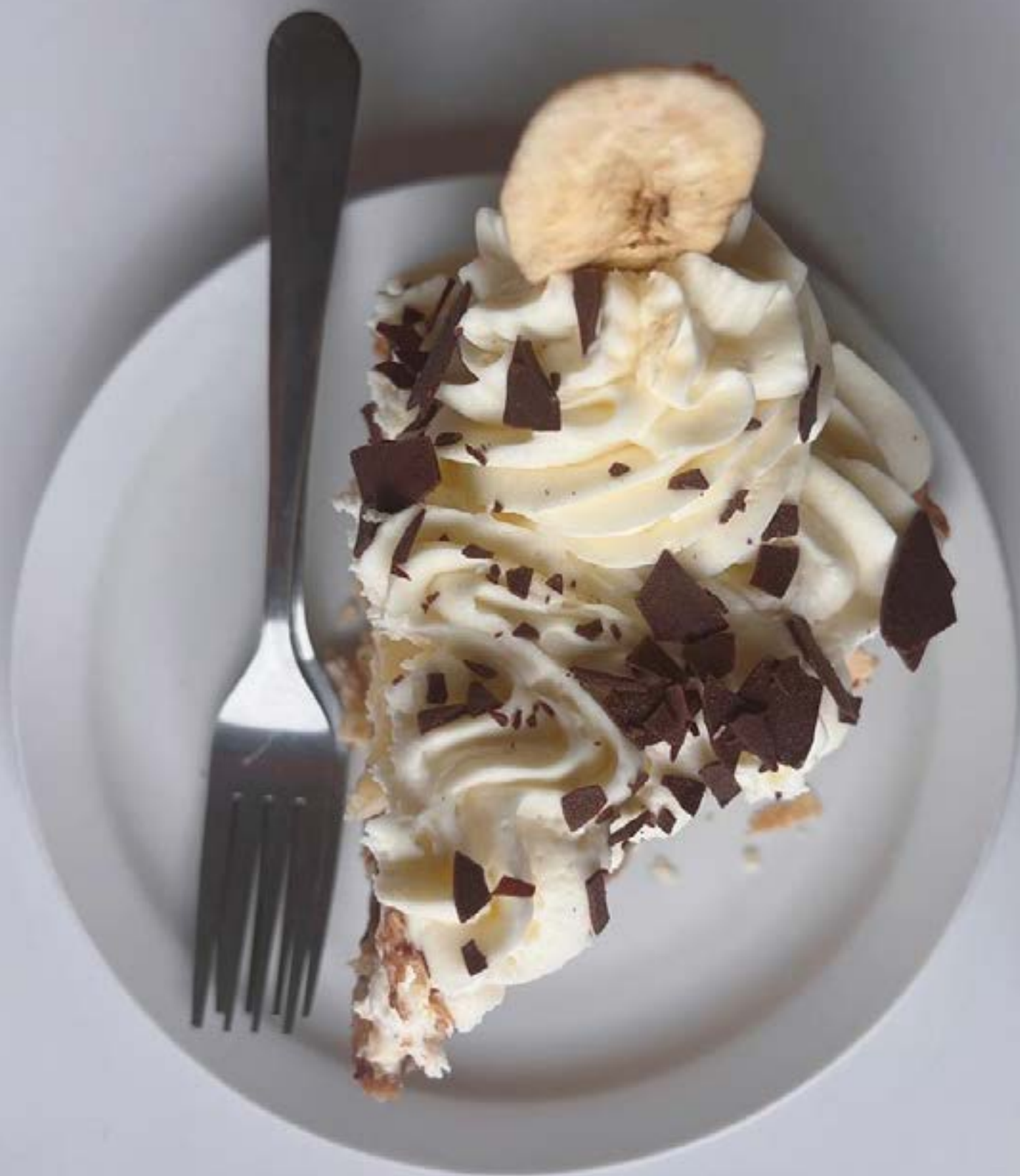
A slice of banana creme pie with nuts, and whipped cream.