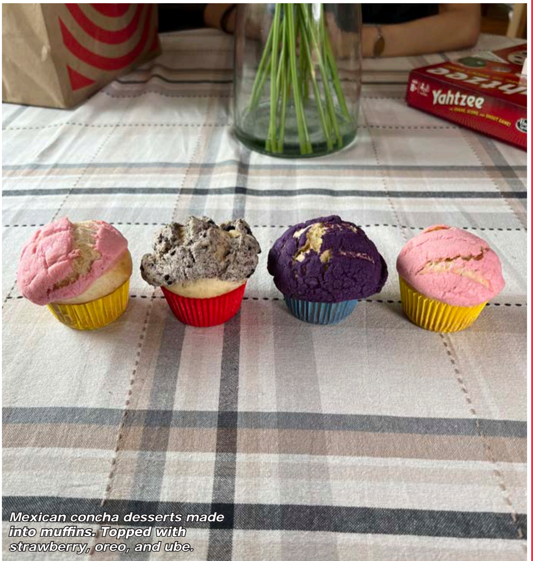
Mexican concha desserts made into muffins. Topped with strawberry, oreo, and ube.