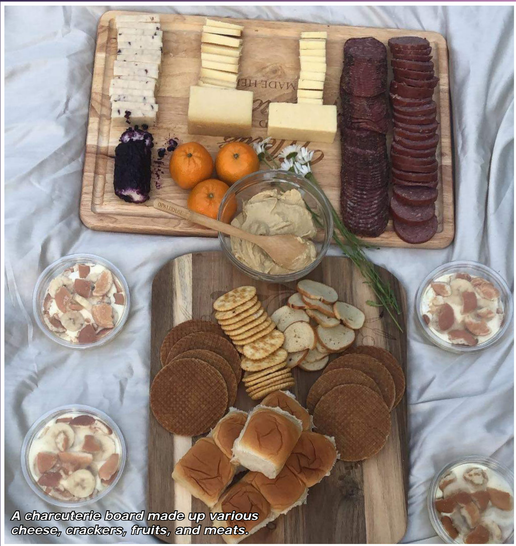
A charcuterie board made up various cheese, crackers, fruits, and meats.