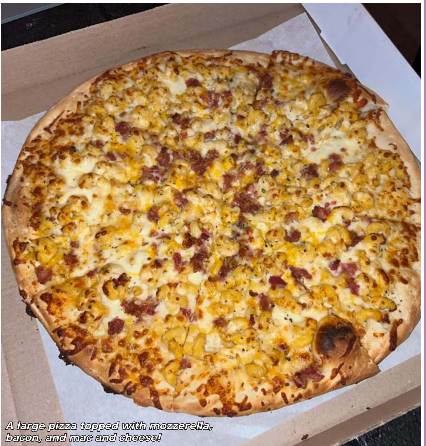
A large pizza topped with mozzarella, bacon, and mac and cheese!