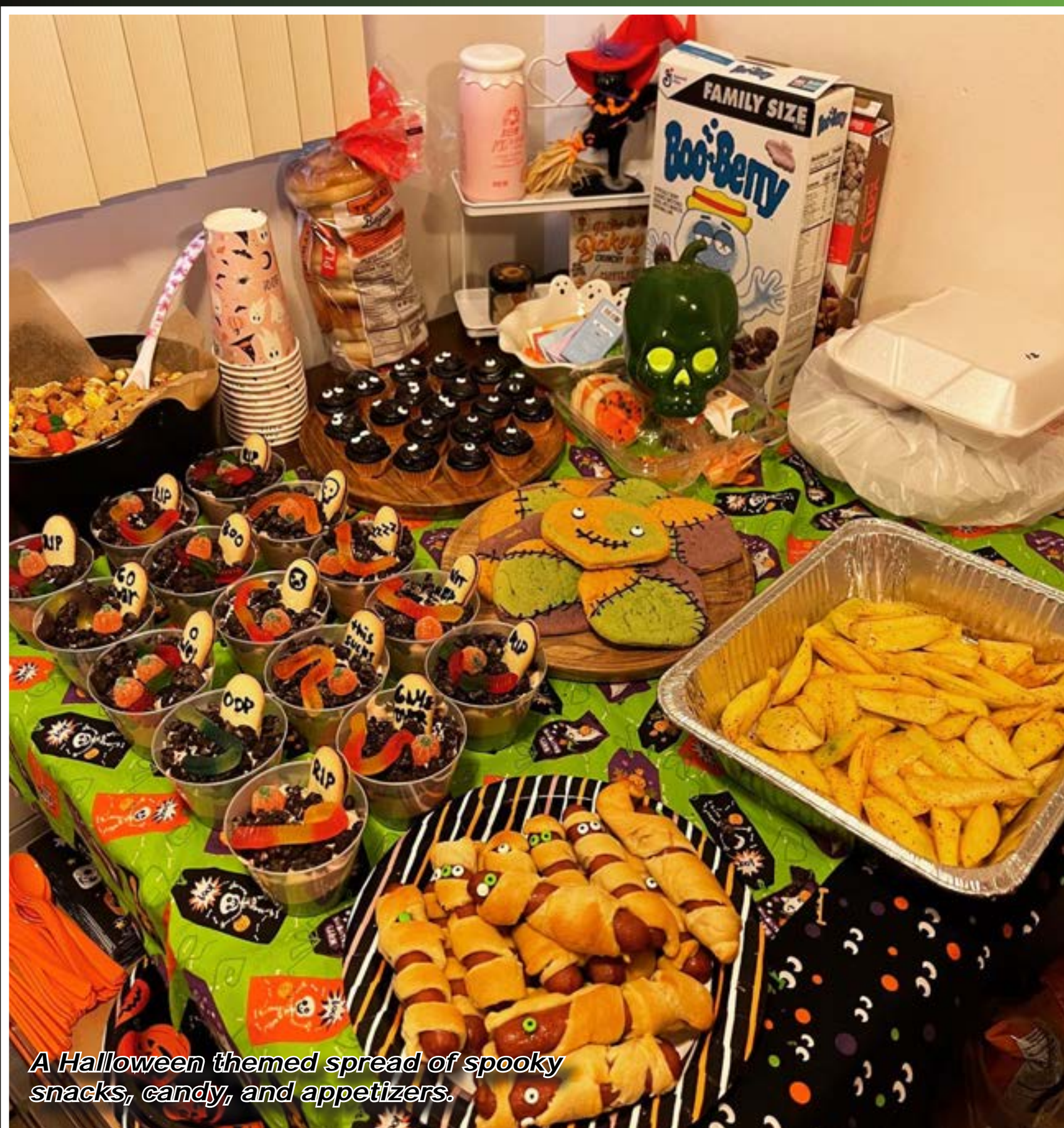
A Halloween themed spread of spooky snacks, candy, and appetizers.