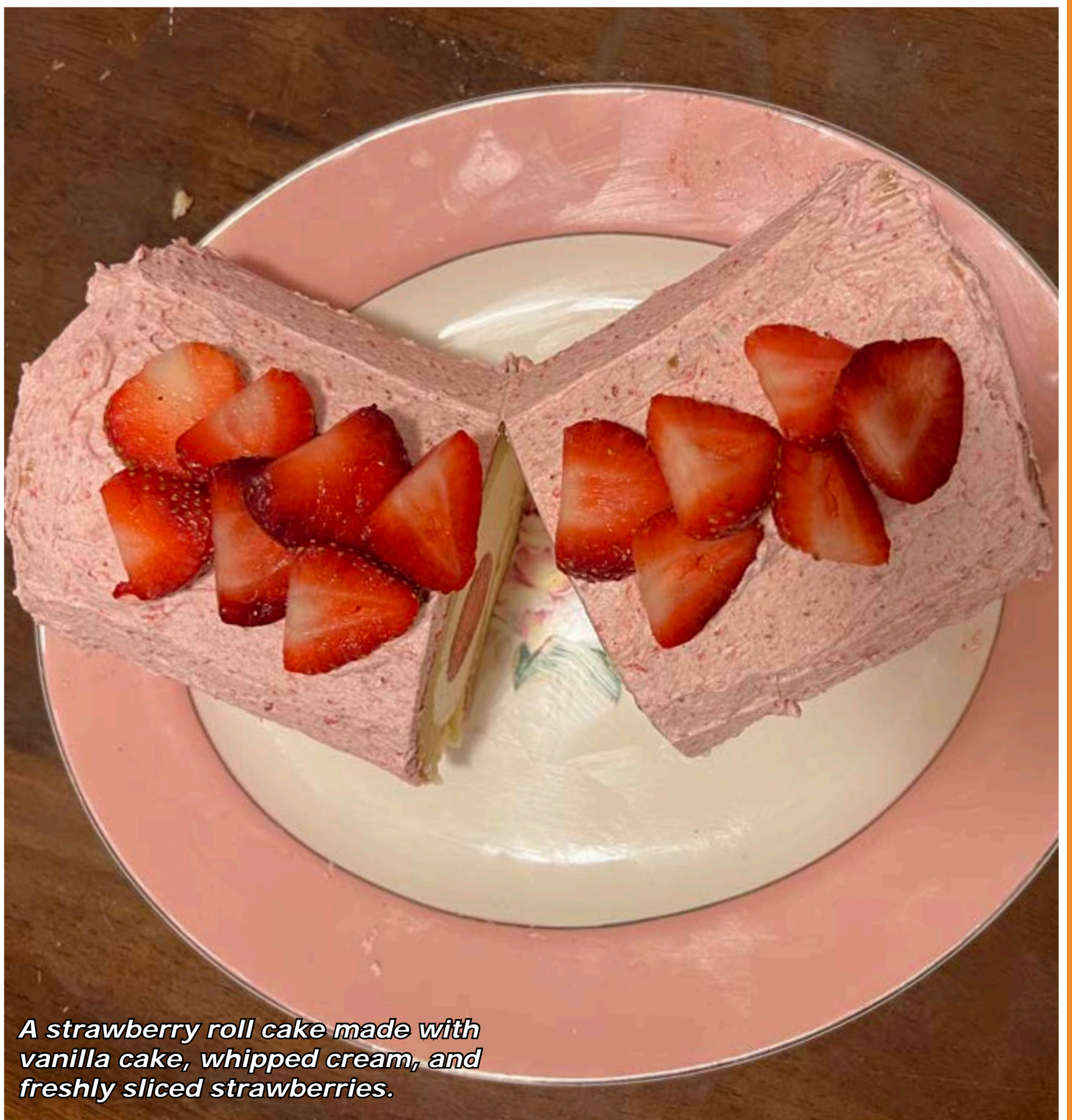
A strawberry roll cake made with vanilla cake, whipped cream, and freshly sliced strawberries.