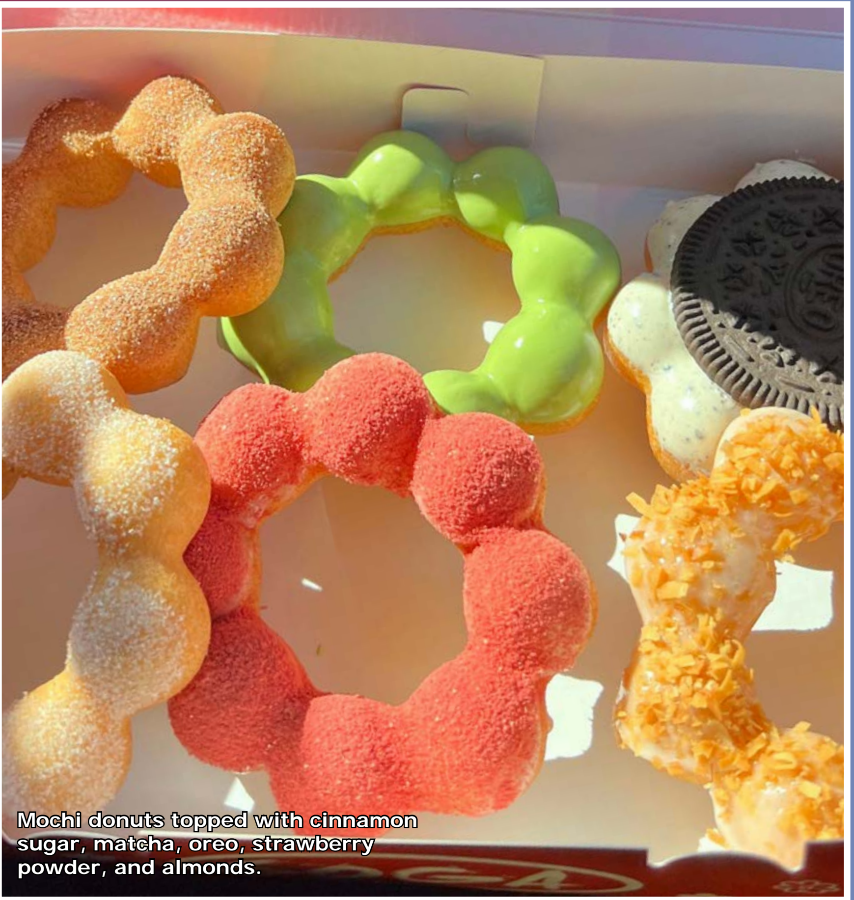
Mochi donuts topped with cinnamon sugar, matcha, oreo, strawberry powder, and almonds.